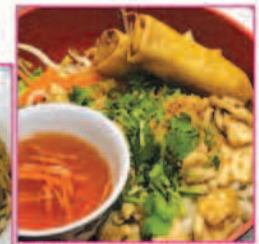
Chicken Noodle Bowl