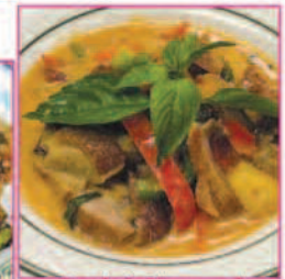
Duck & Pineapple Curry