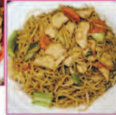
Chicken Lo Mein