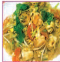
Pad Woon Sen