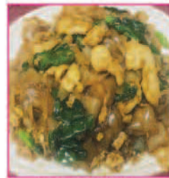
Pad See Eew