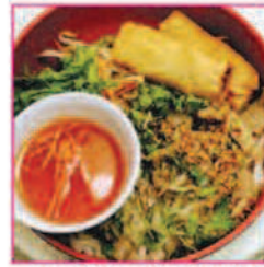
Beef Noodle Bowl

Caution!!! Even just the Hot is very spicy. Please beware we will not refund or exchange if you can't handle the spice you order.