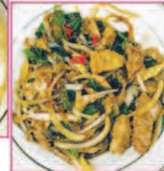
Pad Prig King