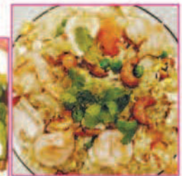
Thai House Fried Rice